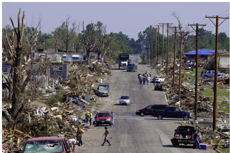
Tornado damage and debris in Joplin

Joplin is located primarily in Jasper County, Missouri; its southern edge extends into Newton County. Duquesne is located on Joplin's east side. Both cities are in the four corners area of Missouri, Arkansas, Kansas, and Oklahoma. Joplin's population is 50,175 people, while Duquesne's is 1,763 people. Joplin swells to approximately 240,000 people on work days. An estimated 825,000 people live within one hour of the city.