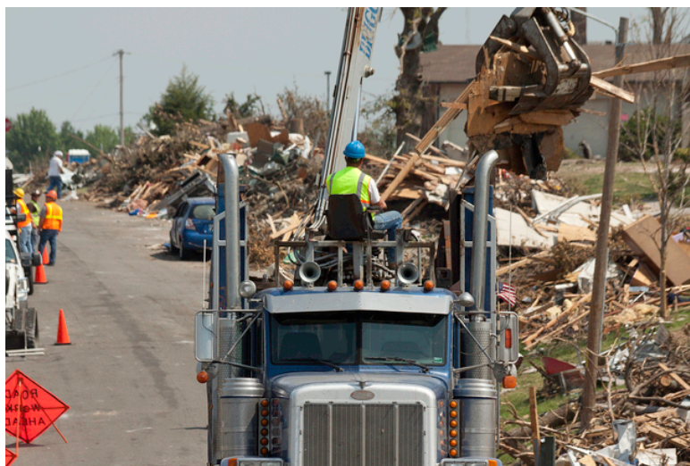
Crews remove debris in Joplin

On May 31, 2011, President Obama authorized a special debris removal initiative, Expedited Debris Removal (EDR). This initiative's purpose was to help clear loose tornado debris from public rights-of-way and private, residential property in the hardest-hit areas to help hasten the communities' recovery. The EDR initiative also provided a 90 percent Federal cost-share for eligible debris removal costs. The State of Missouri paid the remaining 10 percent.