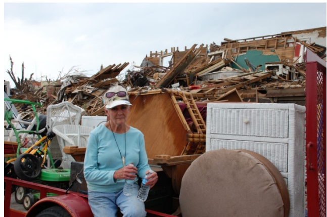
Impacted Joplin resident

The city PIO directed the supplemental PIO assistance and used it to assist with overall messaging, media relations, and product development/dissemination.