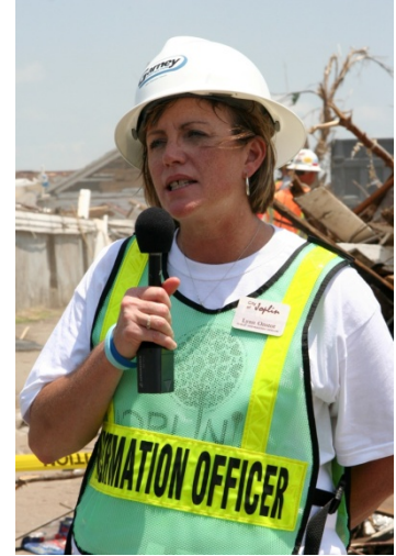
Media Interview by Joplin PIO at debris removal operation

City officials released the majority of debris products and served as the principal spokespersons. The only exceptions were if a message involved an issue, usually related to technical information that was more appropriate for a specific agency. For example, the U.S. Environmental Protection Agency (EPA) released the results of air monitoring during debris removal operations since FEMA had tasked the agency to perform that function. Duquesne city officials established similar arrangements with FEMA and other response partners for developing and releasing public information products.