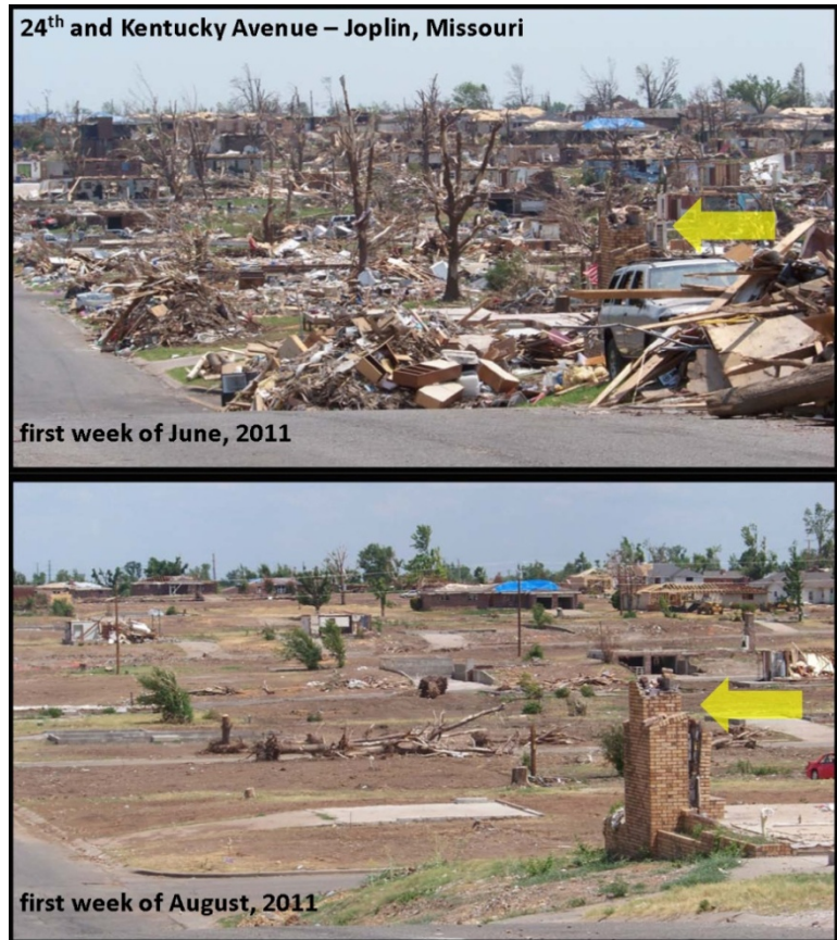
The impact of EDR on a Joplin intersection

The public information strategies employed after the Joplin tornado illustrate how timely and accurate public information is essential for helping disaster-impacted communities, citizens, and businesses achieve a successful recovery. The cohesive and effective partnership established by the cities of Joplin and Duquesne, the State of Missouri, FEMA, and other partners was instrumental for successful public messaging. The partnership helped to ensure that the citizens of Joplin and Duquesne had the right information at the right time to make informed choices about their recoveries.